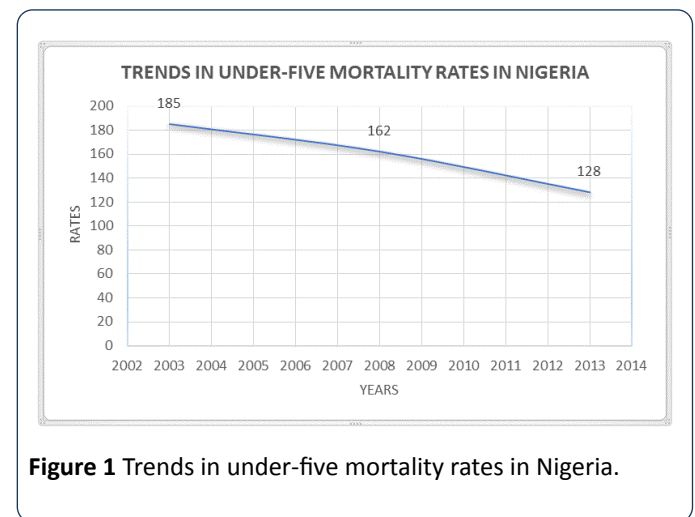
Figure 1 Trends in under-five mortality rates in Nigeria.

Figure 1, shows the trend in under-five deaths in rates within the period of 2003-2013. In 2003, out of every 1,000 under-five children reported in the survey 185 were reported dead, while 162 and 128 were reported dead in 2008 and 2013. The result established that there was a decline of 31 percent in under-five mortality within the 10 years period.